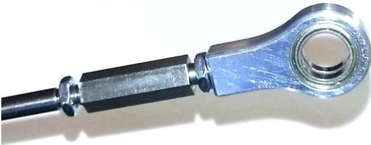
The ball bearing rod end is fully adjustable and attaches to the left side of the shifter (not tightened).