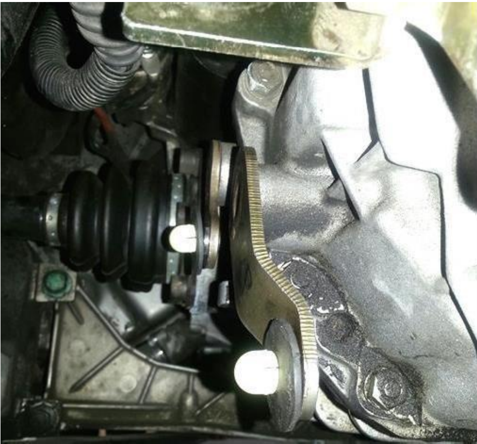
This transmission picture view indicates the yellow plastic inserts applied on the transmission cable posts before rod end fitment.