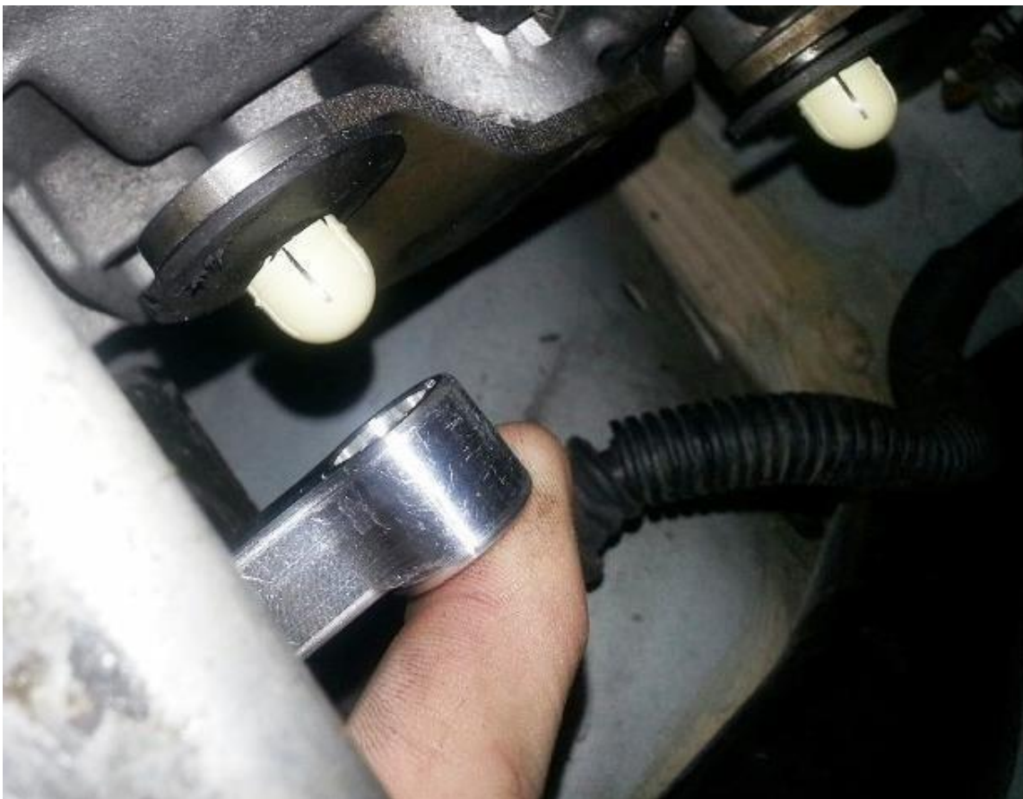
Connect rod end to post.