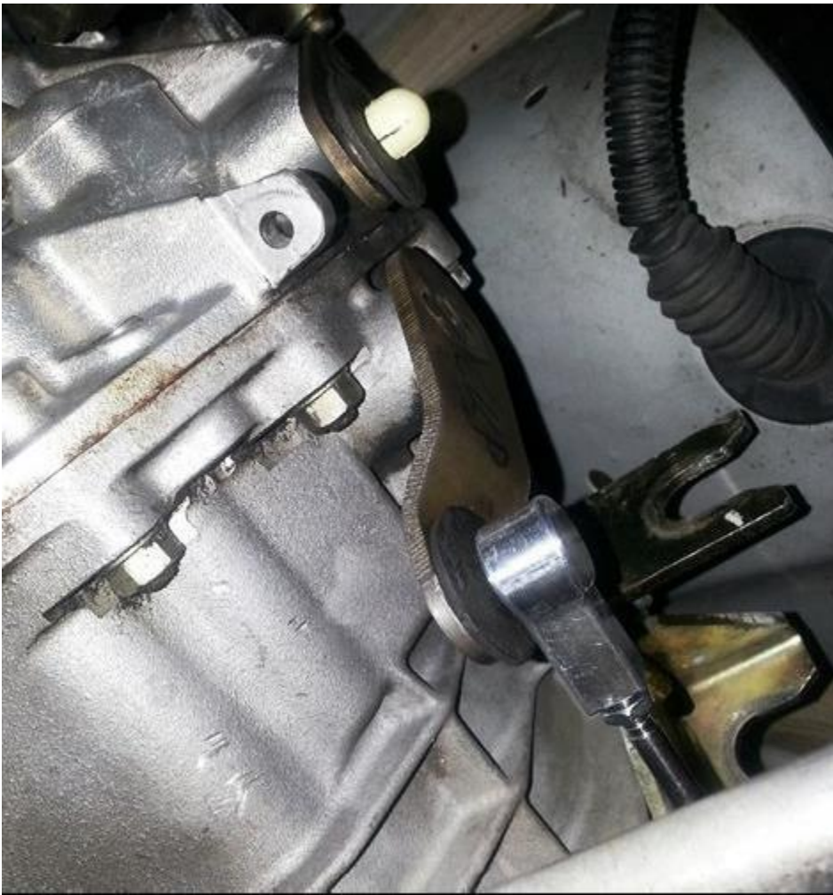
Attached and secured correctly (Requires force to remove).